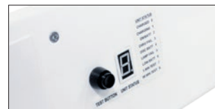
Optional Numeric Indicator (G2-NI) for dependable visual status and fault detection.