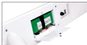
Tool-less hinged door for easy and safe access to isolated low voltage battery compartment.