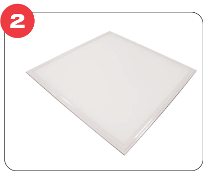
2' X 2'