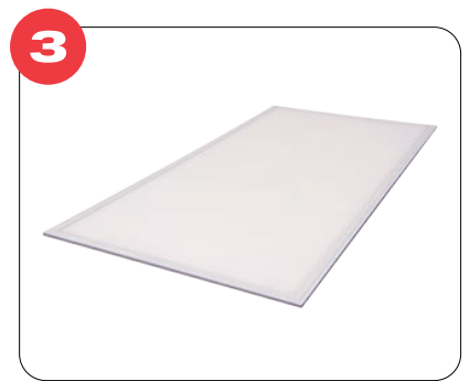
2' X 4'