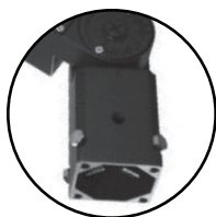
AXL-SF-BR Die-cast Slip-Fitter

Specifications are subject to change without notice. Installation must be performed in accordance with Barron Lighting Group installation instructions.