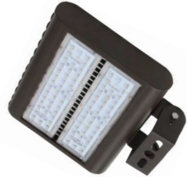
Standard Trunnion Mount