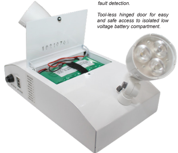
Tool-less hinged door for easy and safe access to isolated low voltage battery compartment.