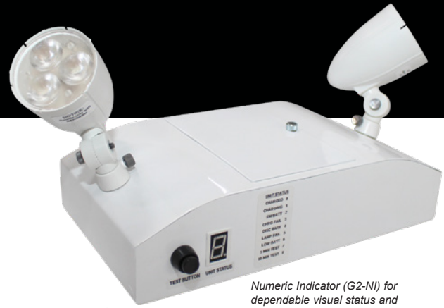
Numeric Indicator (G2-NI) for dependable visual status and fault detection.