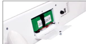
Tool-less hinged door for easy and safe access to isolated low voltage battery compartment.