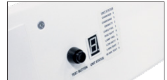
Optional Numeric Indicator (G2-NI) for dependable visual status and fault detection.