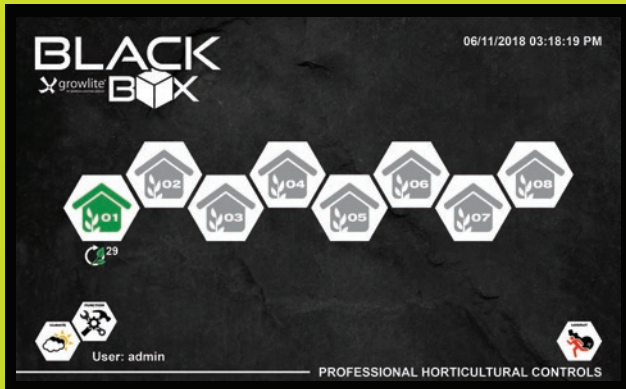
Start Menu/Main Screen - Active Room