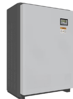
ELV 1 SERIES