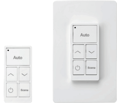
Shown with wallplate accessory (LE-WP)