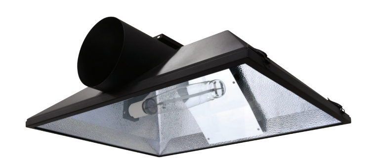
AVAILABLE WHILE SUPPLIES LAST