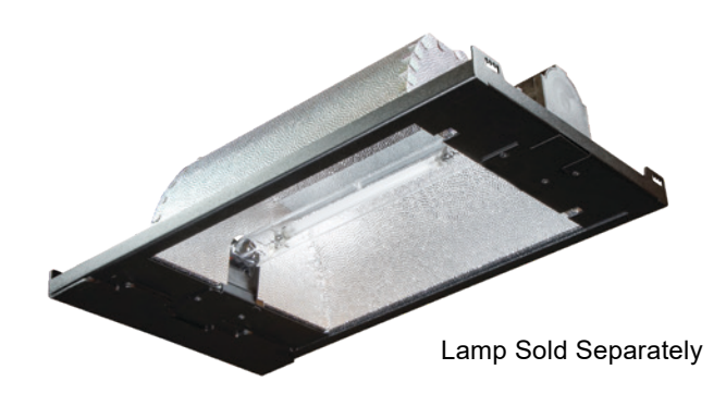
Patent No. 10,720,741