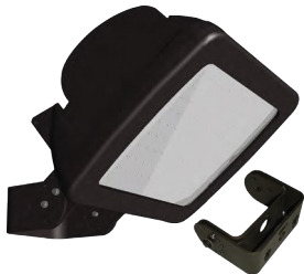
Trunnion Mount (Option: T)