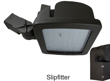
Slipfitter (Option: SF)