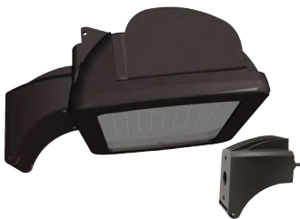
Pole Mount Arm (Option: A)