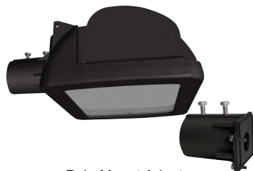
Pole Mount Adapter (Option: PA)