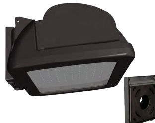
Wall Mount (Option: W)