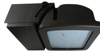
Wall Mount Box (Option: WB)