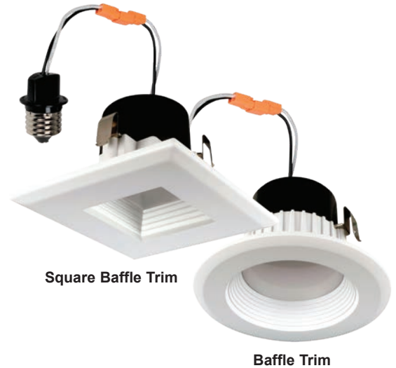
Square Baffle Trim