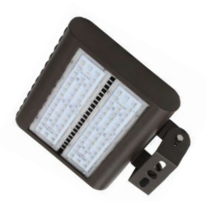
Standard Trunnion Mount