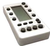
Programming Remote ARB-REMOTE (Sold Separately)