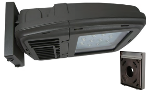
Wall Mount (Option: W)