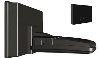
Wall Mount with Battery Backup