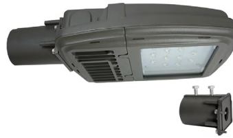
Pole Mount Adapter (Option: PA)