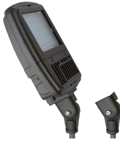
1/2" Knuckle Mount (Option: K)