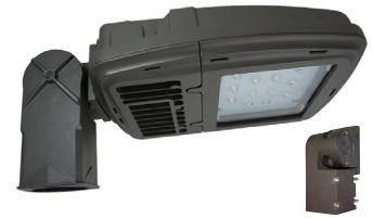
Slipfitter (Option: SF)