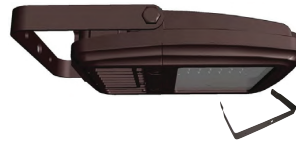
Yoke Mount (Option: Y)