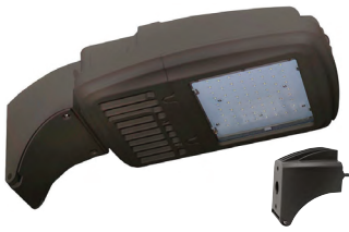
Pole Mount Arm (Option: A)