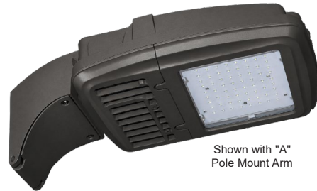
Shown with "A" Pole Mount Arm

Model: _____ Date: _____ Accessories: _____ Job Name: _____ Type: _____