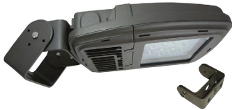
Trunnion Mount (Option: T)