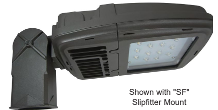
Shown with "SF" Slipfitter Mount