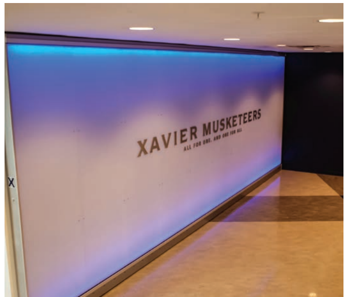
BOTTOM Xavier University Cincinnati, OH