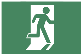
Without Arrow (2pcs)