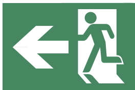
Arrow Left (1pc)