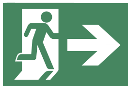
Arrow Right (1pc)