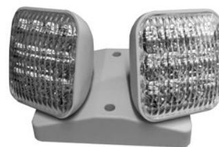
Double Lamp with No Options