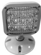
Single Lamp with Weatherproof (WP) Option