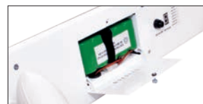
Tool-less hinged door for easy and safe access to isolated low voltage battery compartment.