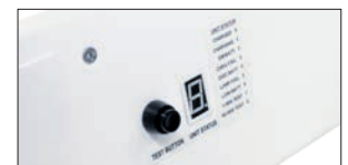
Optional Numeric Indicator (G2-NI) for dependable visual status and fault detection.