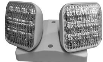
Double Lamp with No Options