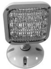
Single Lamp with Weatherproof (WP) Option