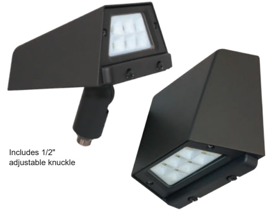
Includes 1/2" adjustable knuckle