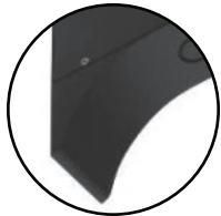
AXL-A-BR Die-cast Arm