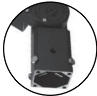
AXL-SF-BR Die-cast Slip-Fitter