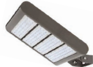
Standard Trunnion Mount